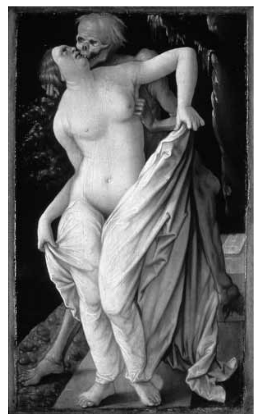
FIGURE 5 Hans Baldung, Death and the Woman, c. 1518–19, Kunstmuseum, Basel.