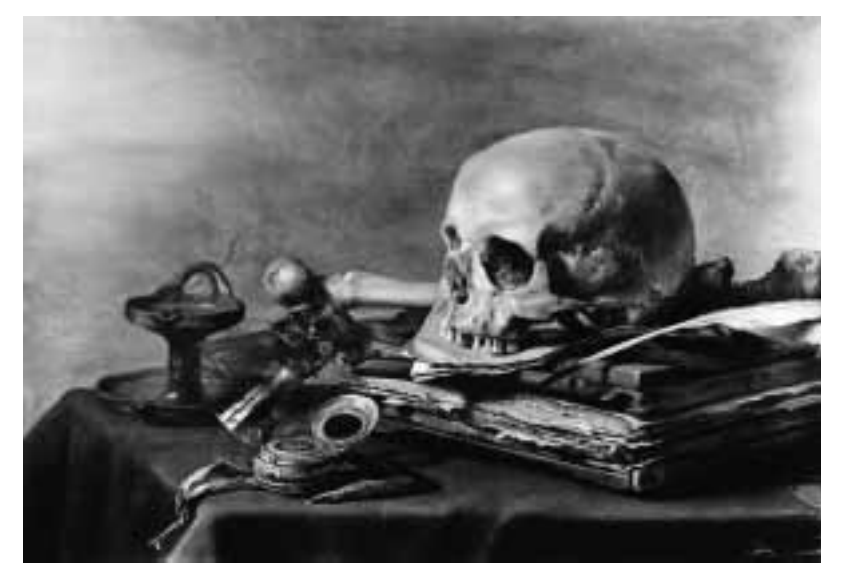
FIGURE 4 Pieter Claesz, Vanitas Still Life, 1630, Royal Cabinet of Paintings, Mauritshuis, The Hague.

The adjacency in Smith's Self-Portrait of two distinct marks of authorship-one left visible, the other effaced-resonates with the simultaneous appearance/disappearance of the "world" beneath the superordinate figure of the skull: the instrument, as it would appear, of Smith's subjectivity. The skull, in other words, represents the ossature not of Smith-as-person but rather of Smith-as-subject. It does so in part through allusion to popular seventeenth-century vanitas paintings featuring skull-text configurations. In Pieter Claesz's Vanitas Still-Life (1630), for example, a realistically rendered skull seems to be making a meal out of some books and loose papers (fig. 4). Like other vanitas still lifes, Claesz's is as much an appreciation of ephemeral, sensuous pleasures as it is a warning against a too-exclusive devotion to such pleasures. In his Self-Portrait, Smith presents himself as a man familiar with sensuous pleasures: from the tasseled drapery in the upper right corner, to the upholstered chair in which he sits, to his meticulously rendered lace neck cloth, with its intricate vine-and-flower motif, to his similarly soft and undulant gray hair. That is, he hardly seems like a man intent on abridging himself of superfluities. Yet his self-elegy performs a valediction to such worldly "Joies" and "Toies," and, as in Claesz's Vanitas,