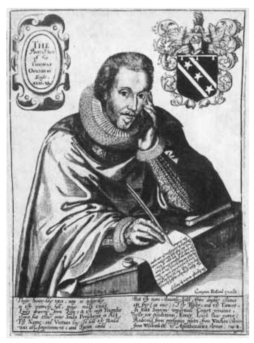
FIGURE 3 Renold Elstrack, The Portracture of Sir Thomas Overbury, 1615, British Museum, London.