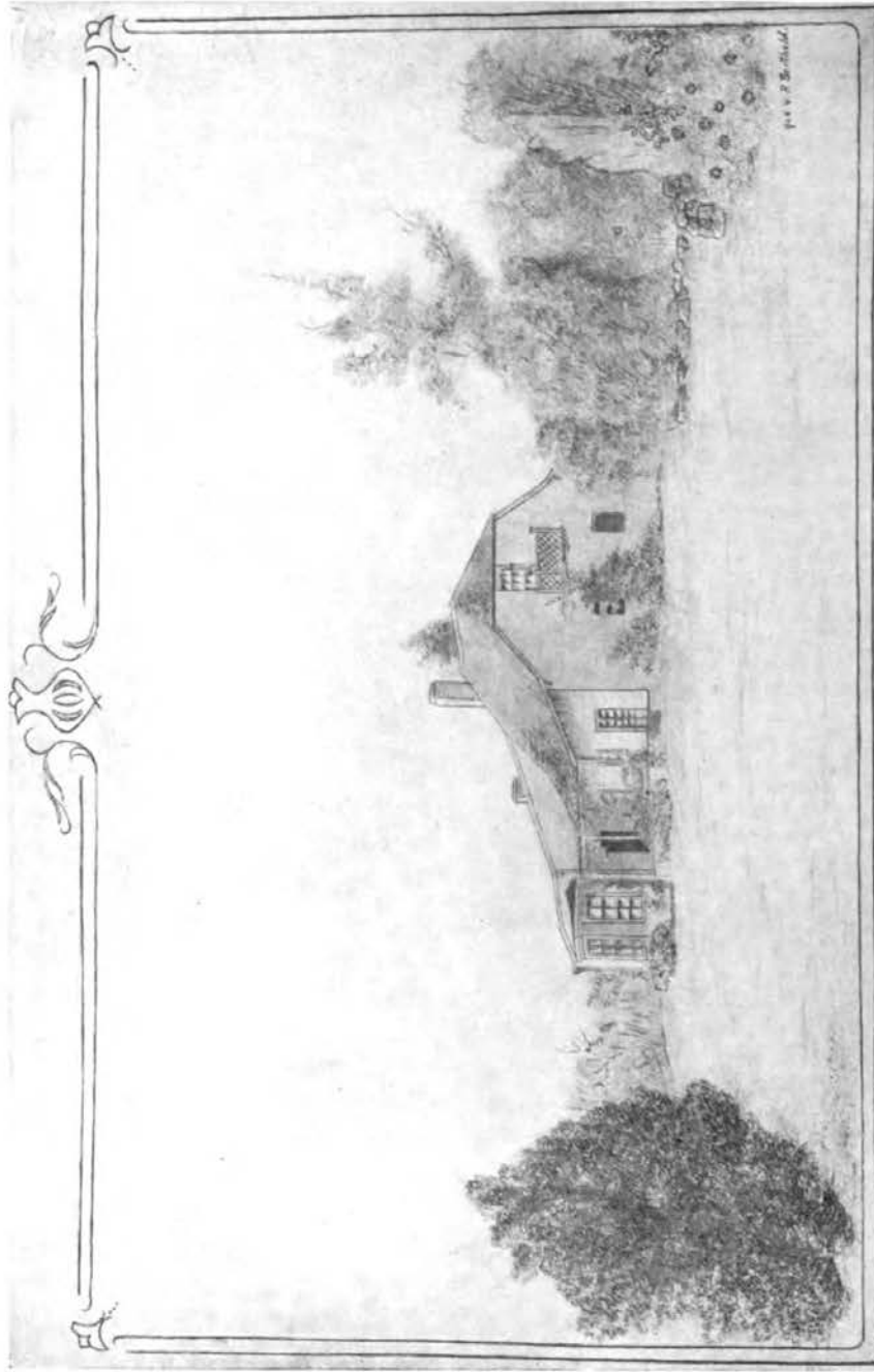
HILLDROP, NEWCASTLE, NATAL