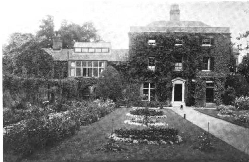
DITCHINGHAM HOUSE, BUNGAY