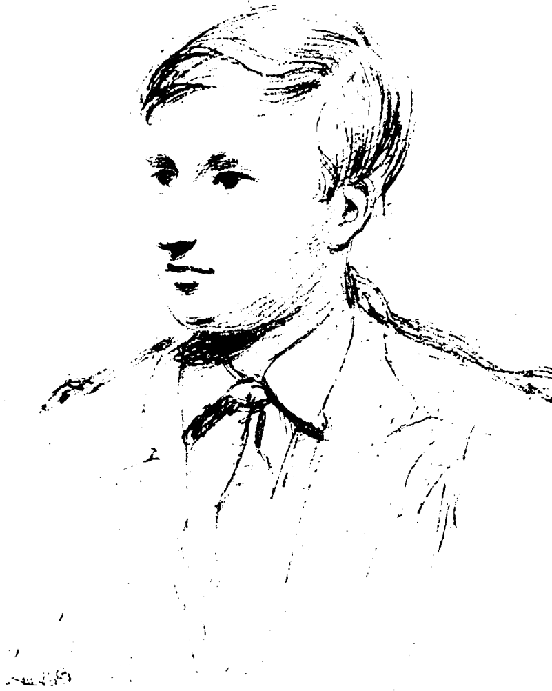
H.R.H. AS A YOUTH