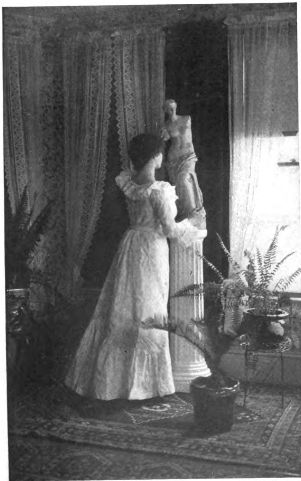
Photograph by Marshall, 1902