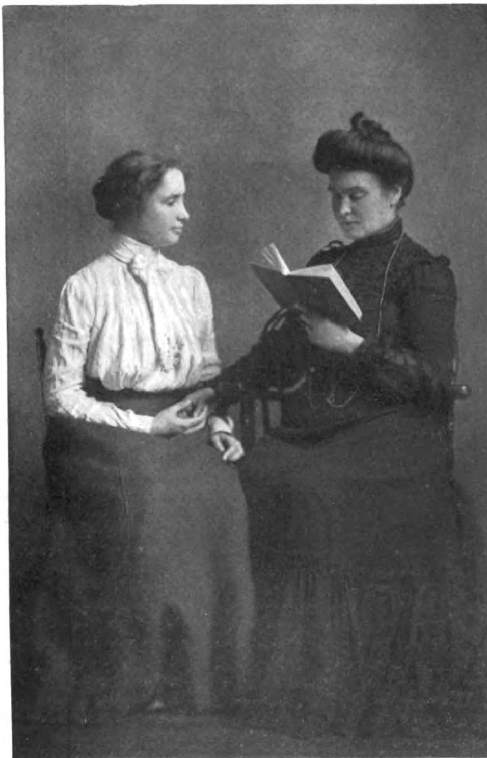
Photograph by A. Marshall, 1902