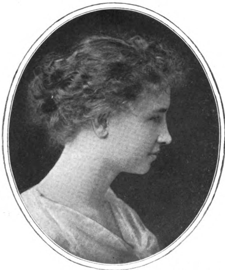
Photograph by Marshall 1899