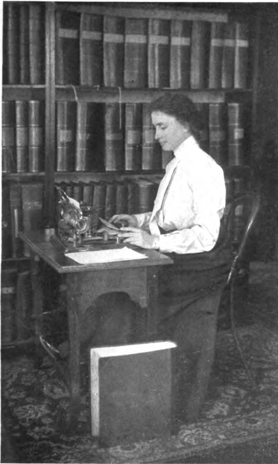
Photograph by Marshall, 1902