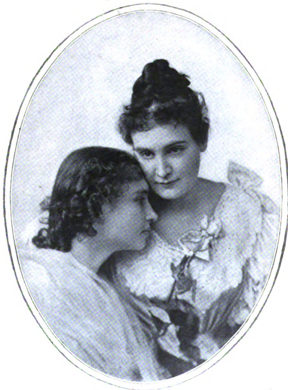
Photograph by Falk, 1895