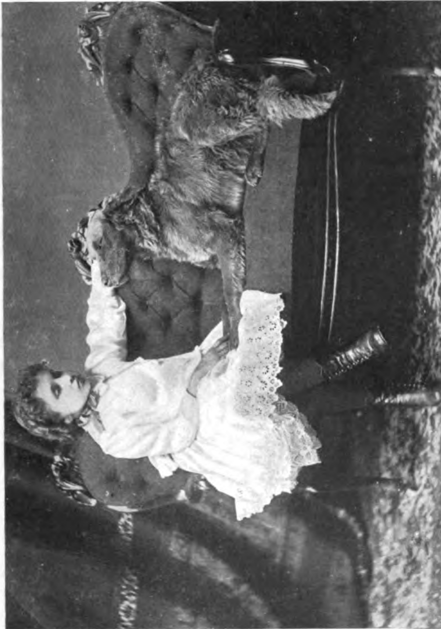
Photograph by Deane, 1887