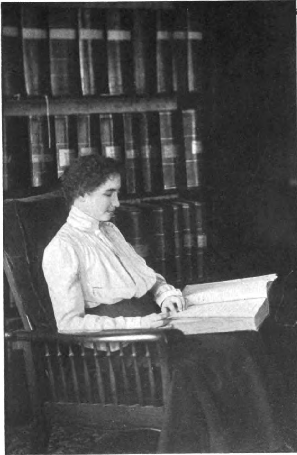
Photograph by Marshall. 1902