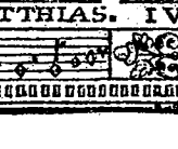
JOSEPH . BENJAMIN . MATTHIAS . JUDAS .