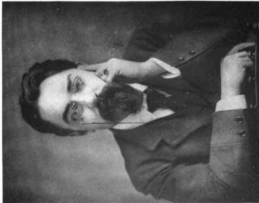
SIDNEY WEBB (1891. Age 32)