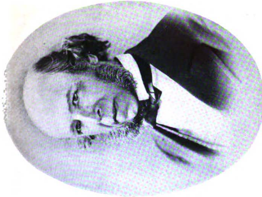
HERBERT SPENCER (1820-1903)