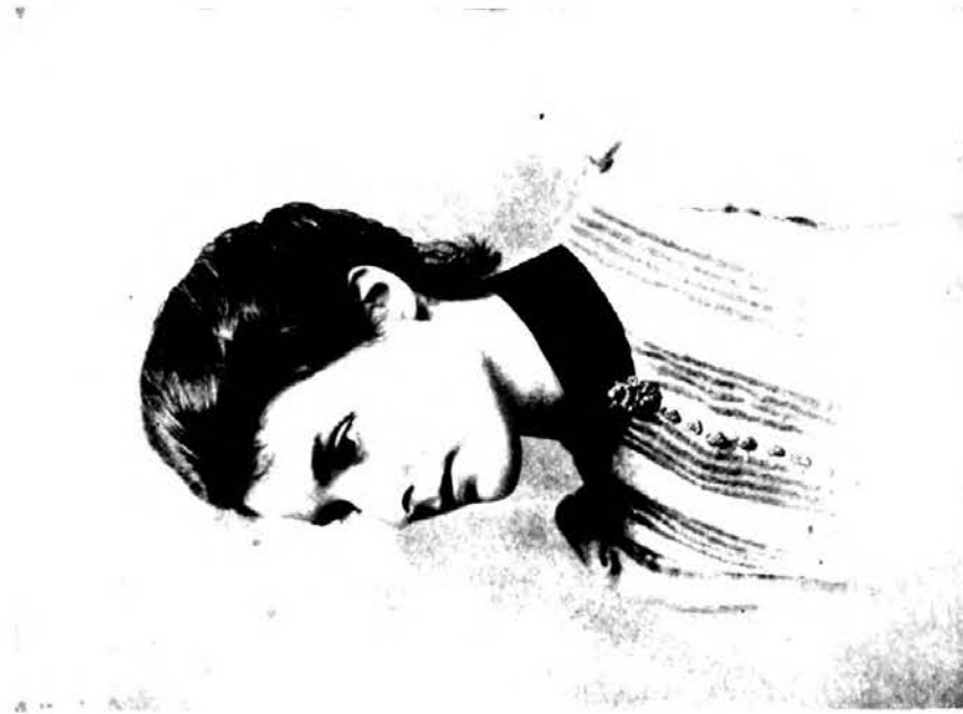
BEATRICE POTTER (1891. Age 33)