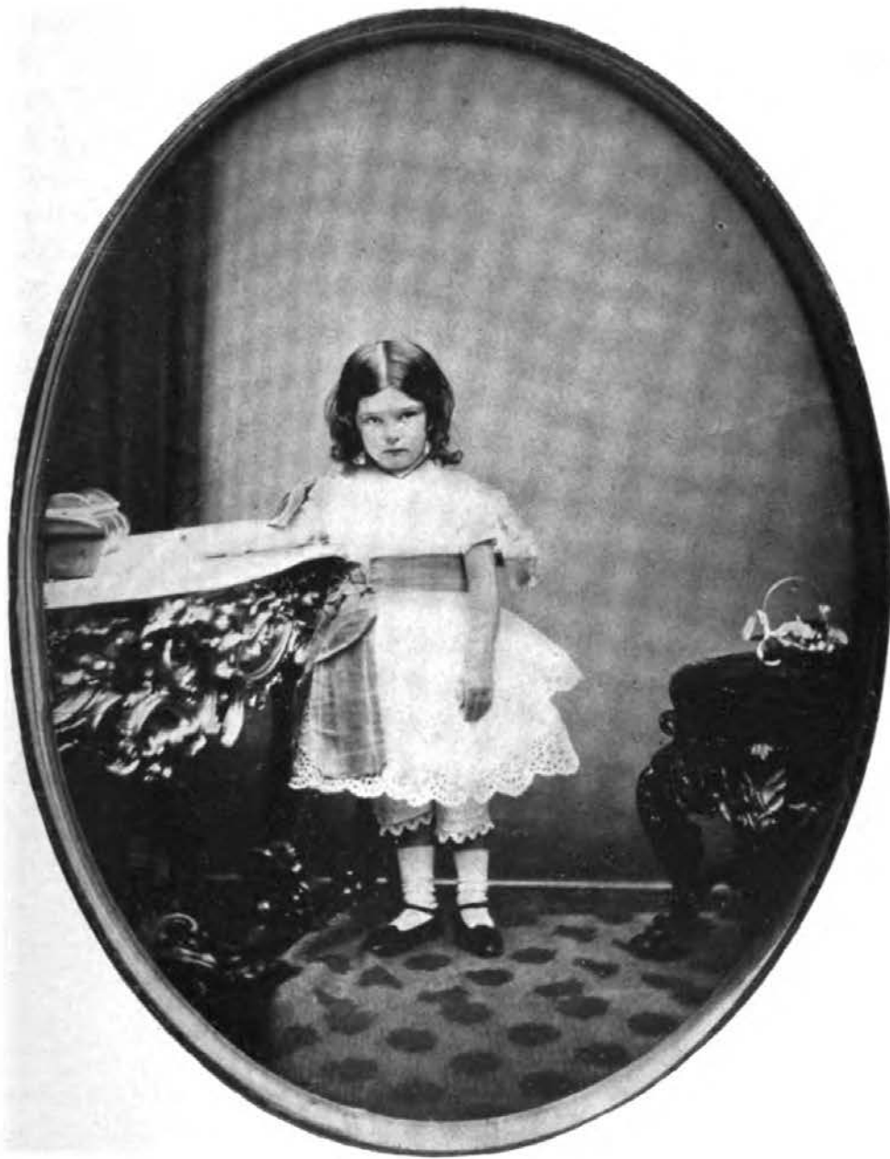
BEATRICE POTTER At the Age of 5