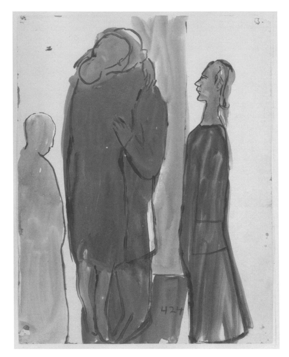
{\it Home coming}\ (collection\ Jewish\ Historical\ Museum, Amsterdam, copyright\ Charlotte\ Salomon\ Foundation).