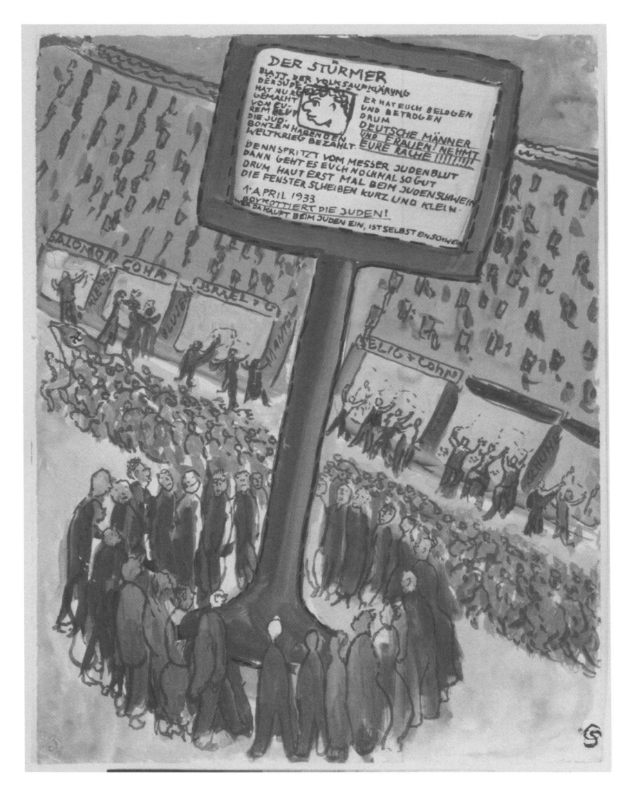
{\it Boycott\ Day}\ ({\it collection\ Jewish\ Historical\ Museum, Amsterdam, copyright\ Charlotte\ Salomon\ Foundation}).