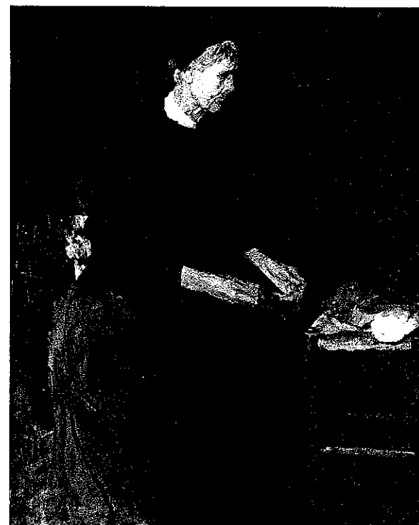
2 Wilhelm Leibl, Old Parisian Woman , 1869/70, oil on wood, 81,5 × 64,5 cm. Wallraf-Richartz-Museum, Cologne

old woman of Paris, he used their titles to self-consciously insinuate himself into the Frenchness of realism. Showing one woman smoking, Leibl deliberately situated his painting in line with the most Parisian of modern female typologies, that of the modern Parisienne , so often painted by Manet, Monet and their contemporaries in the late 1860s. 7 The type was usually best exemplified by a young fashionable lady of uncertain class status, often in the public mind associated with prostitution; the old woman, in contrast, attends to her rosary and thus performs a more traditional role. Thus a central issue in seeking to understand the import of Leibl's time in Paris turns on international realism's implicit class strategies and ethics. These two paintings, with their mix of Parisian realist strategies, mapped over thematic interests already developed while in Munich, became emblems of the possibilities and limitations of international realism just before the outbreak of the Franco-Prussian War.