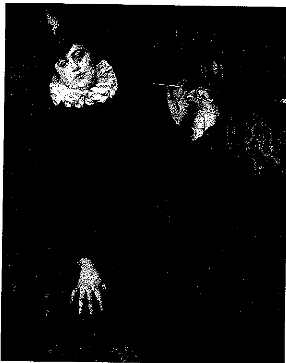
1 Wilhelm Leibl, Young Parisian Woman , 1869, oil on wood, 64,5 × 52,5 cm. Wallraf-Richartz-Museum, Cologne