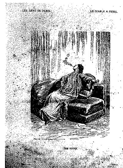
6 Paul Gavarni, Sans ouvrage , n. d.; illustrated in L'œuvre célèbre de Gavarni. 479 dessins originaux (Paris: Collection Hetzel, n. d., 1860s). Mortimer Rare Book Room, Smith College Libraries, Northampton, Massachusetts

Such a reading of the painting becomes more complicated, however, once we place the Old Parisian Woman next to the young one – a painting of an old woman engaged in prayer over her rosary, accompanied not by a range of decorative objects, but a piece