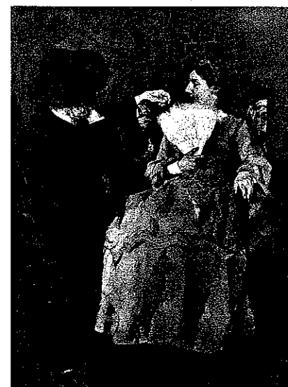
4 Wilhelm Trübner, In the Studio , 1872, oil on canvas, 82 x 61 cm. Bayerische Staatsgemäldesammlungen – Neue Pinakothek, Munich, Inv.-Nr. 8108

The young Savoyard Boy , for instance, signed explicitly "Paris 1869," takes its subject-matter from the lowest classes then to be found in Paris and situates the model within current debates over European national formation and French aggression, since the annexation of Savoy by France in March 1860 had precluded either the border region's merging with Switzerland or its remaining with Italy (fig. 5). Here, Leibl found a modern type, even if asleep, deeply tied to the same forces of European state rivalry that enabled