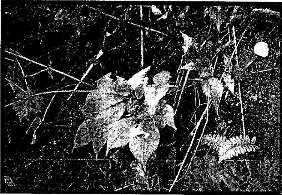
Ginseng plant with berries in the Fall