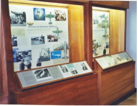
Display Cabinets Machal Museum

changed or approved almost every word that I wrote. He wrote all the material that appears in the cabinet devoted to our fallen comrades, and provided, through some sort of miracle, photographs of each one of the 40 men killed. AVI and I will