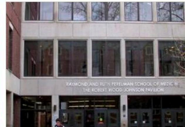
Holman Biotech Commons