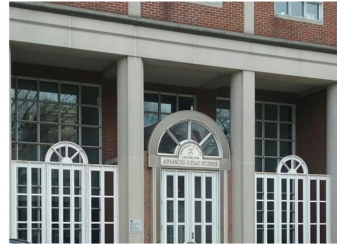
Library for Advanced Judaic Studies at the Katz Center