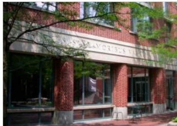
Biddle Law Library