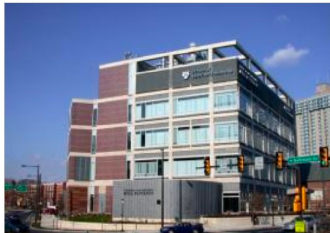
Veterinary Medicine Library