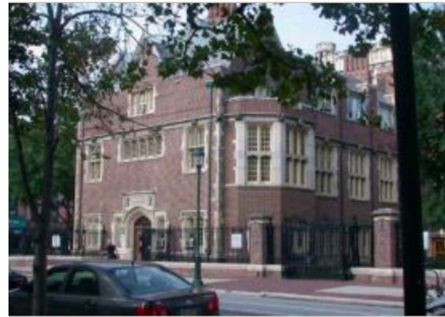
Levy Dental Medicine Library