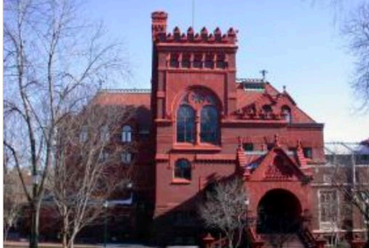
Fisher Fine Arts Library