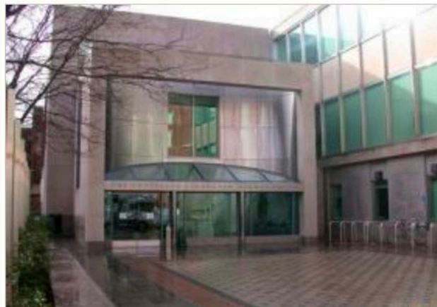
Annenberg School Library