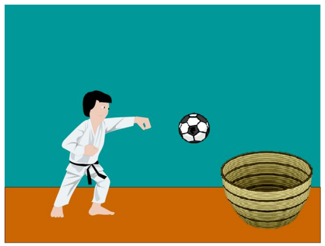
Figure 1—Sample target event

including corrections for small head movements. Participants were seated approximately 60 cm from the Tobii screen, and experimenters adjusted the angle of the screen as necessary to obtain robust views of both eyes, centered in the tracker's field of view. All participants were calibrated using the ClearView software's default 5-point calibration scheme.