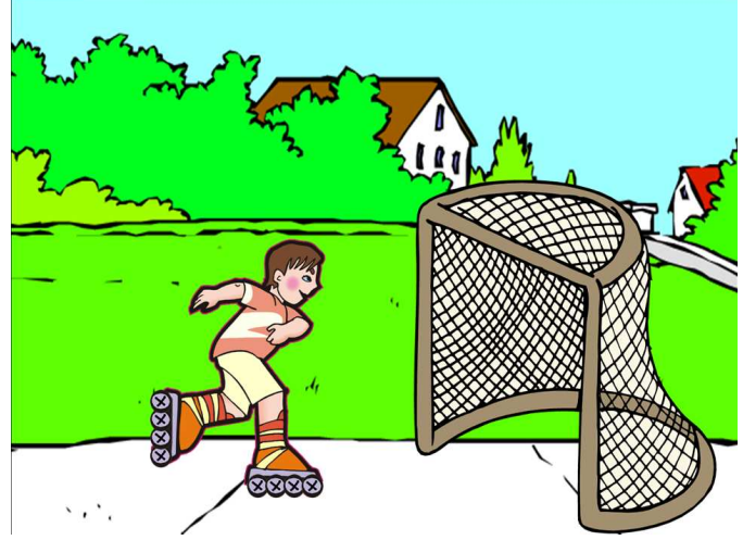
Figure 1—Still frame taken from a target event