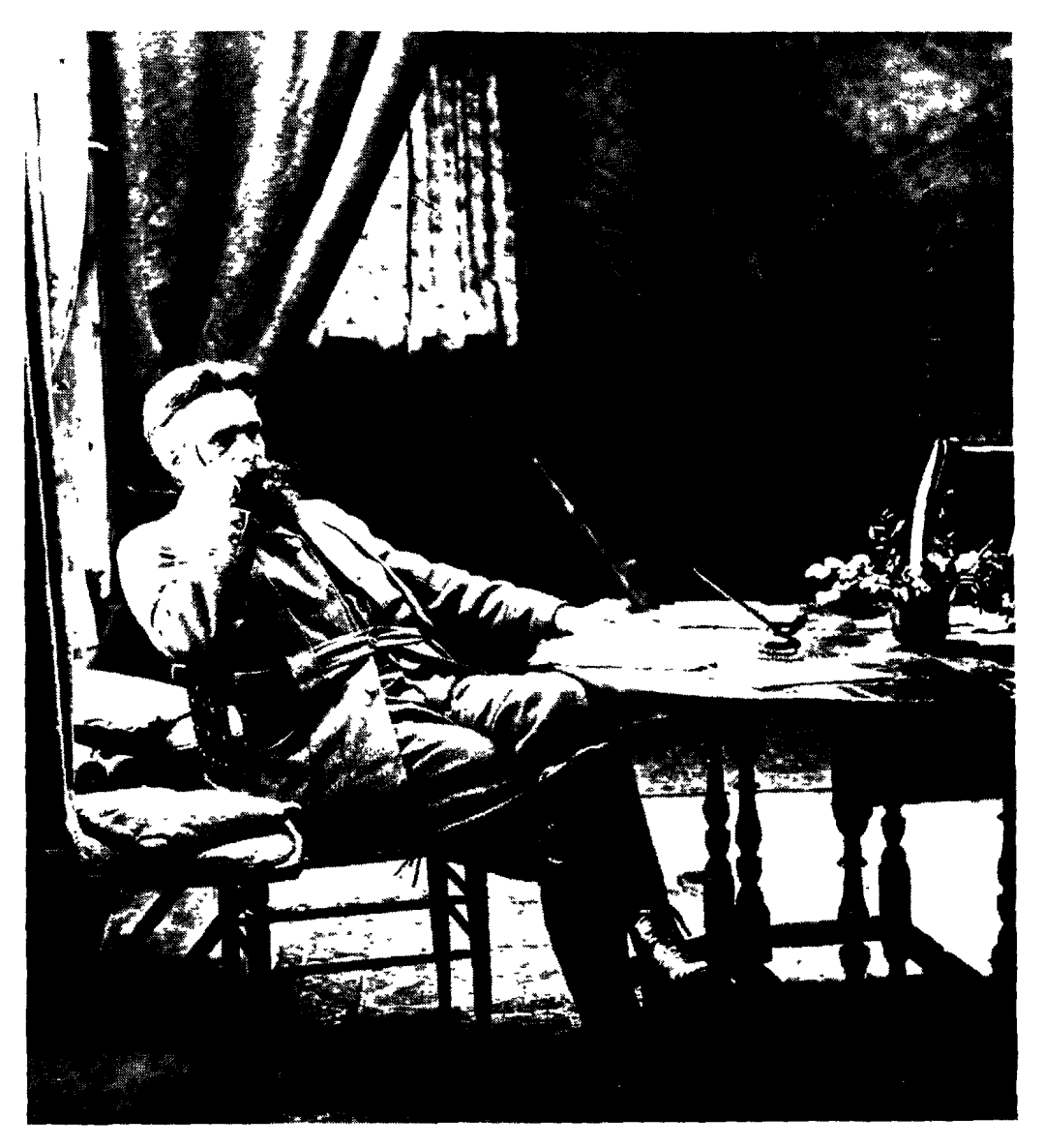
In his studio At Ha-wkes Point, Carbis Bay, December, 1897