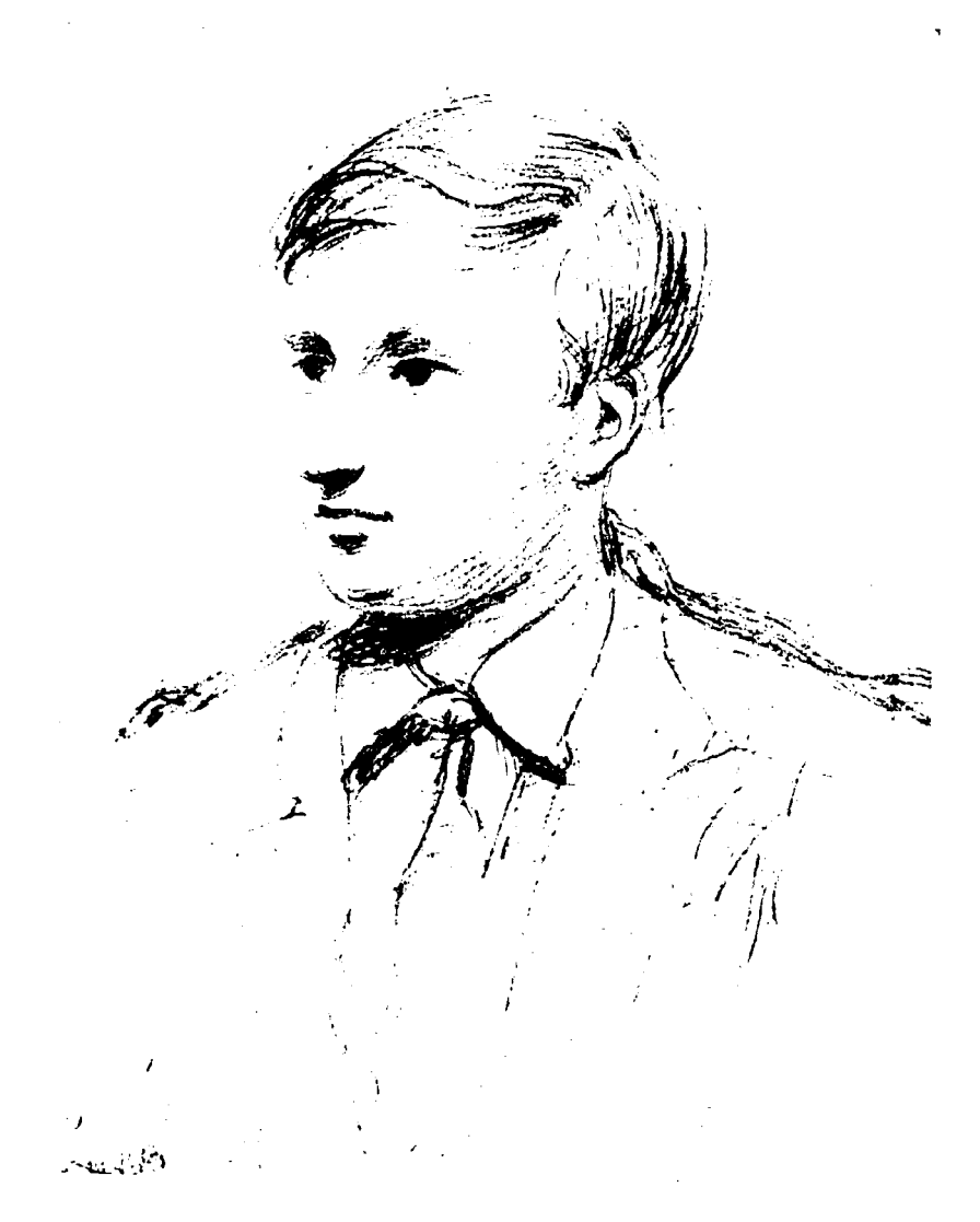
H.R.H. AS A YOUTH