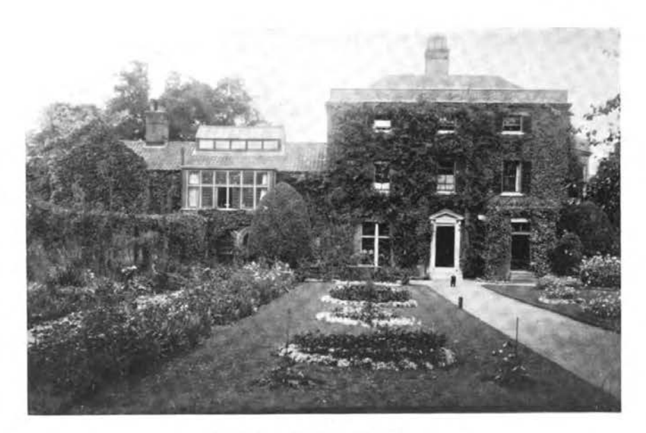
DITCHINGHAM HOUSE, BUNGAY