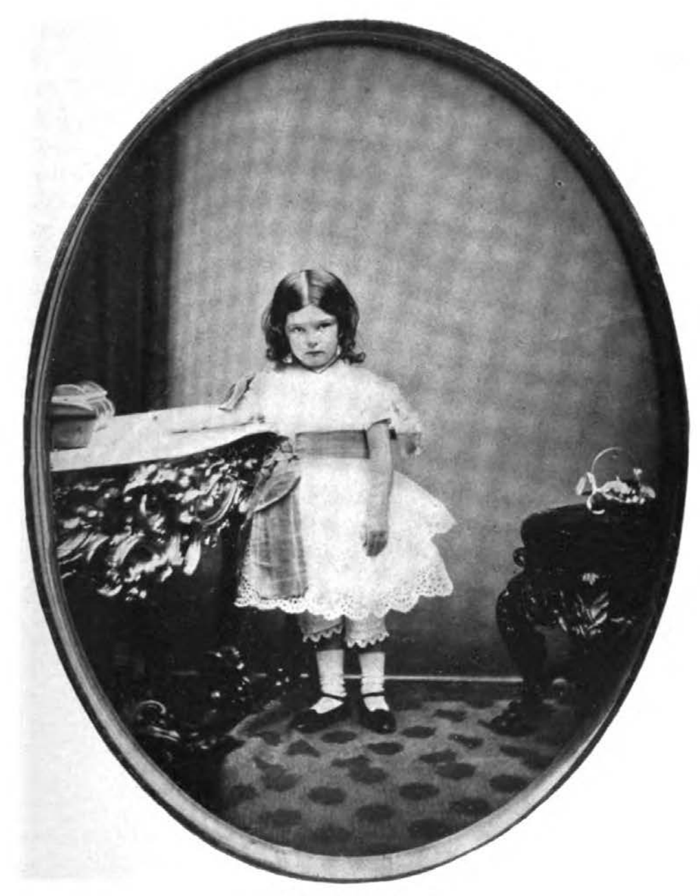
Beatrice Potter At the Age of 5