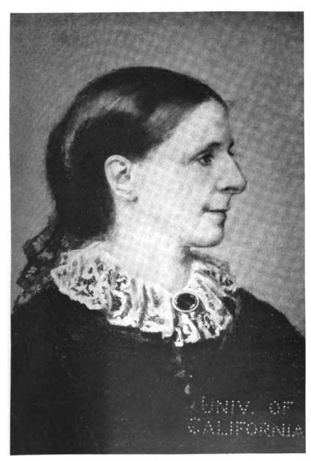
Laurencina Potter (1822–1882)